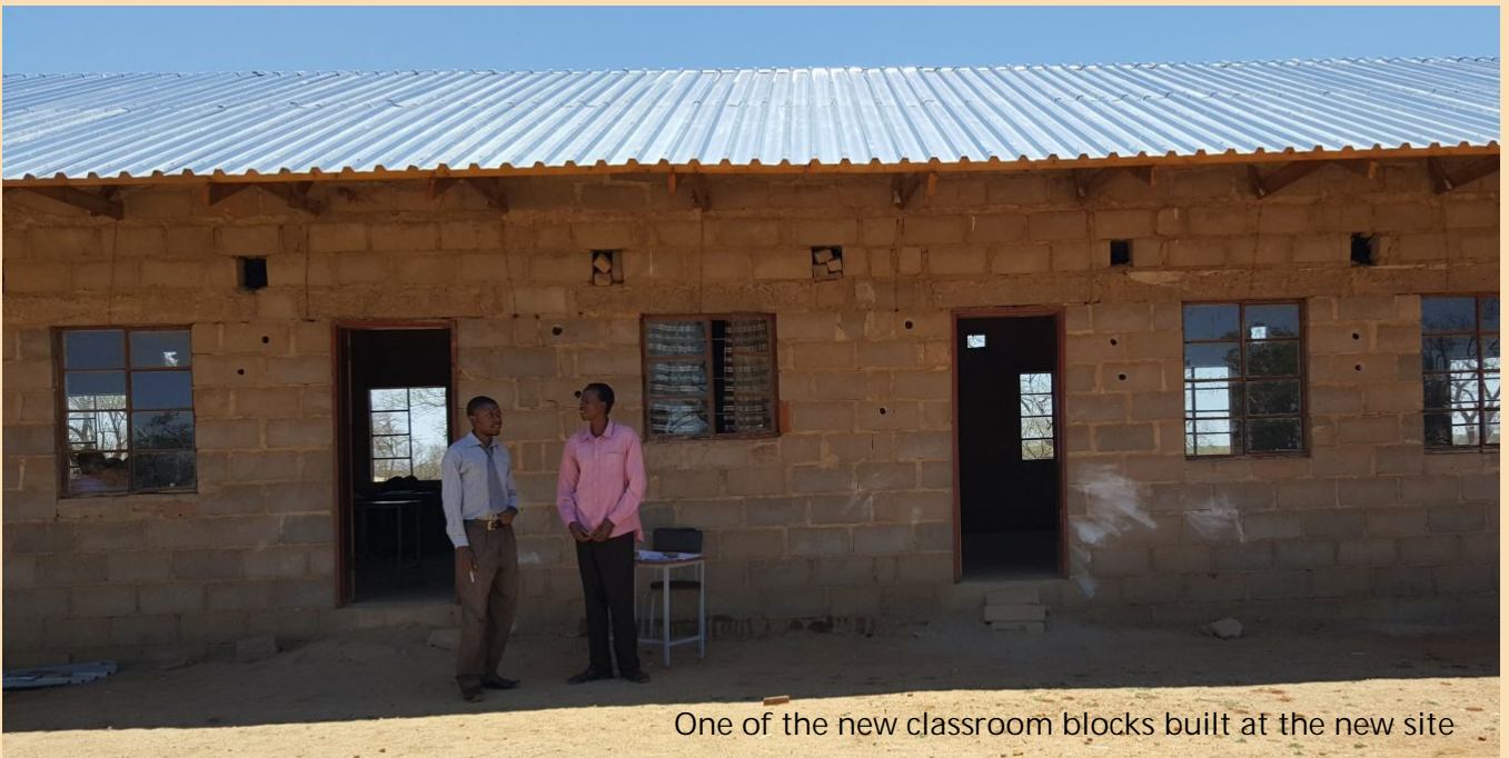
One of the new classroom blocks built at the new site